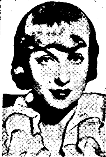
CAROLE LOMBARD Boosts a Friend

Snapshots of Hollywood Collected at Random: Bob Burns, of 11 people, going scientific on us studying tadpoles and what not under a microscope; George Brent nothing if not a time traveler—he dashes to the studio